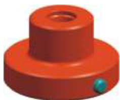
Running & Retrieving Tool