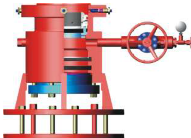
Slip Bottom Connection Casing Head