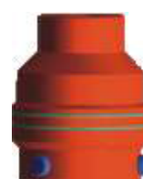
Multi-Functional Test Plug